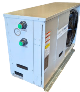
Outdoor Condensing Unit