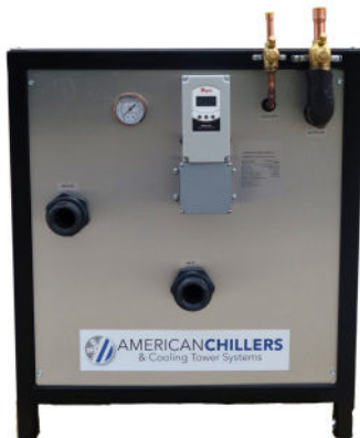
Indoor Heat Exchanger Cabinet