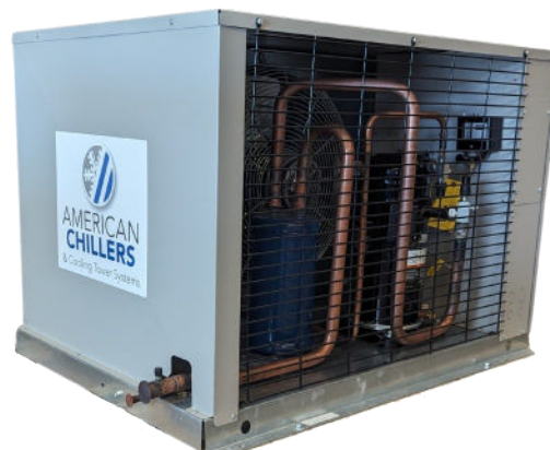
Outdoor Condensing Unit