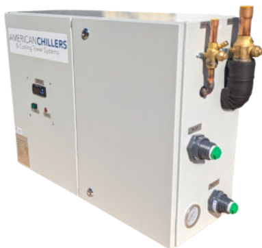
Indoor Heat Exchanger