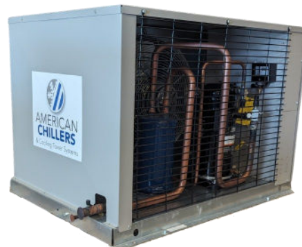
Outdoor Condensing Unit