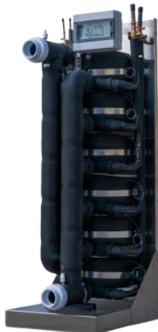
Indoor Heat Exchanger