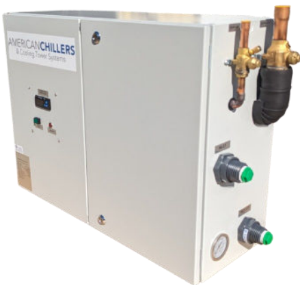
Indoor Heat Exchanger