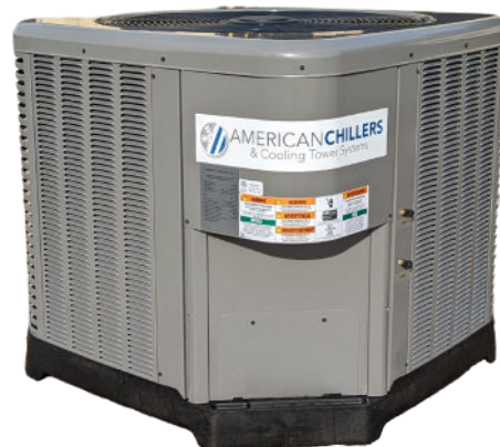
Outdoor Condensing Unit